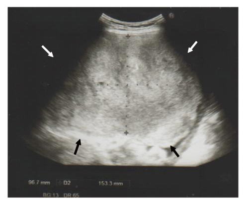
Figure 3. An increased hyperechoic zone (arrows: 15 × 10 cm) by ultrasound examination.