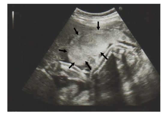
Figure 2. A large homogenous and hyperechoic zone at the Twin A's side of the placenta (arrows: 6 \times 4 cm) by ultrasound examination.

Although we cannot deny the insufficiency of the consideration and/or inspection in the present case, the clinical importance of MSH was re-realized with this case.