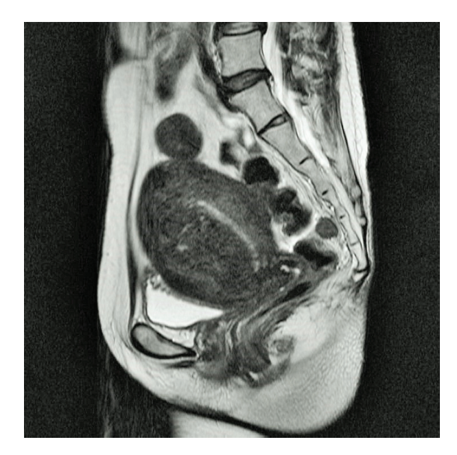
Figure 1. Preoperative MRI of the lower abdomen and pelvis; T2 weighted sagittal section image. Protruded tumor at the uterine fundus 3 cm in diameter and thickening of uterine anterior wall.

A 47-year-old woman, with no specific clinical history, was referred to our hospital, suffering from hypermenorrhea. MRI described uterine myoma with a diameter of 3 cm and thickening of the anterior uterine wall, indicating uterine adenomyosis (Fig. 1). A total laparoscopic hysterectomy was performed. During the operation, the right ureter was dissected from the pelvic brim to the root of the cardinal ligament by blunt dissection. There was endometriotic adhesion around the right cardinal ligament and the dissection was slightly difficult with