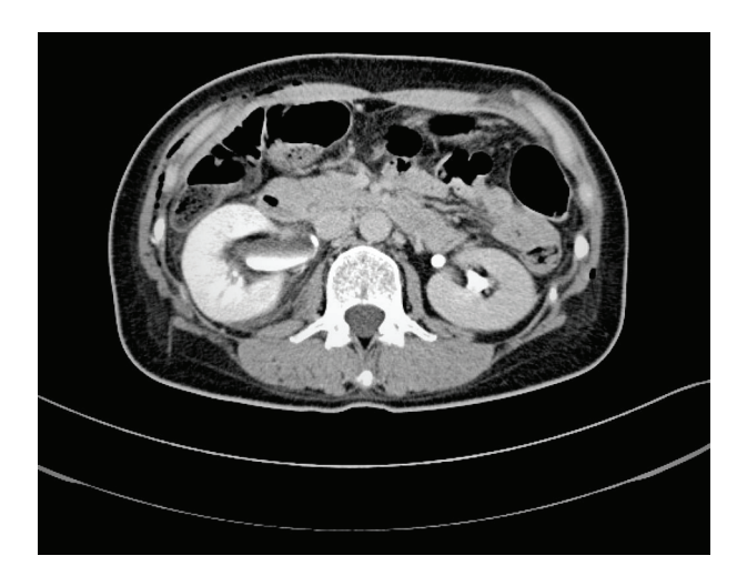
Figure 4. CT scan of the abdomen, with contrast agent injection, on postoperative day 2; dilatation of the right ureter and renal pelvis indicates ureteral obstruction.

management was intended to be conservative, as there was no urinary overflow seen in the CT image, and abdominal X-ray imaging just after CT scan showed urinary flow from the right side to the bladder. We considered that there was transient ure-teral insufficiency, and not ureteral obstruction, and expected spontaneous recovery of ureteral function.