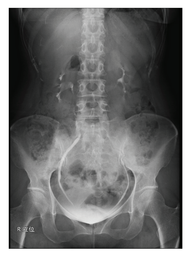
Figure 5. Intravenous pyelogram after the removal of double-J stent; 15-min X-ray; good bilateral ureteral flows with no obstruction.

management was intended to be conservative, as there was no urinary overflow seen in the CT image, and abdominal X-ray imaging just after CT scan showed urinary flow from the right side to the bladder. We considered that there was transient ure-teral insufficiency, and not ureteral obstruction, and expected spontaneous recovery of ureteral function.