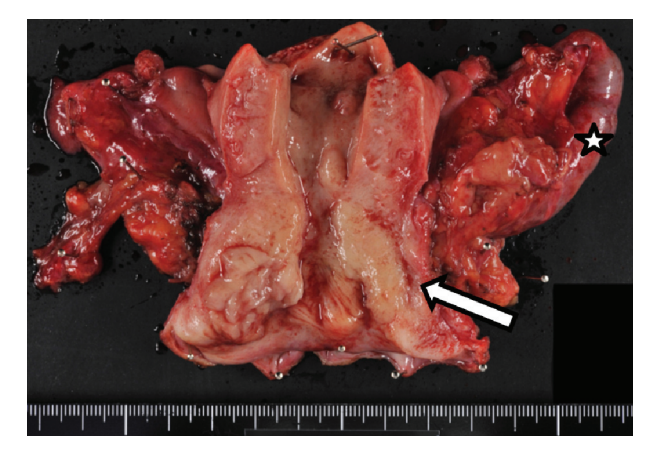
Figure 2. Surgical specimen showing a 35-mm cervical tumor (arrow) and left hematosalpinx (asterisk).

Certain symptoms and serum CA-125 level may be helpful in diagnosis. The Latzko's triad of symptoms, which includes profuse serosanguinous vaginal bleeding, abdominal or pelvic mass and colicky pain relieved by discharge is pathognomonic. However, there are no characteristic symptoms of PFTCs, and the Latzko's triad was reported in only 15% of cases [5]. In the current case, the patient had no gynecologic complaints. Preoperative serum CA-125 level had been reported to increase beyond 35 U/mL in 75-85% of cases, and it increased in 33%, 50%, 89%, and 100% of patients with stage