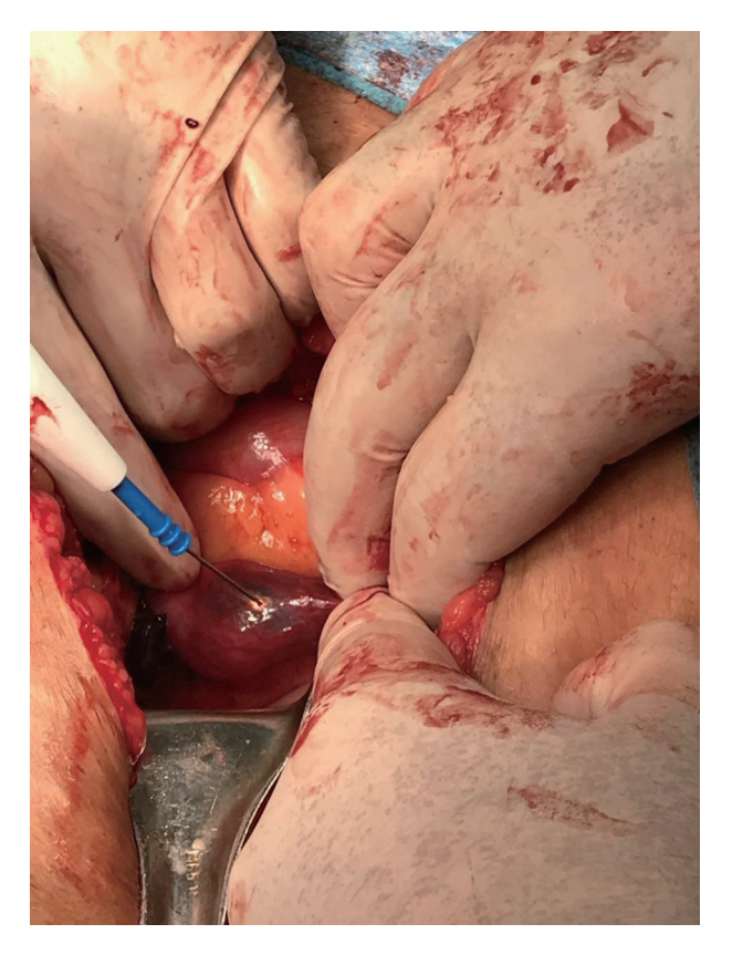
Figure 1. Image showing incidental intra-operative findings of rightsided dilated fallopian tube containing trophoblastic tissues.

pulse of 90 beats per minute. Beta-hCG was 17,229 IU/L. An abdominal computed tomography (CT) scan was ordered by the ED team and showed an empty uterus with thin endometrium with hemoperitoneum and a left-sided complex adnexal mass suggestive of disturbed left ectopic tubal pregnancy (ETP). These findings were confirmed by TVUS done by the gynecology team. At laparotomy, the patient was found to have a massive hemoperitoneum of about 1 L and a ruptured extensively damaged left ETP for which salpingectomy was performed. Exploration of the contralateral side revealed a blueish vascularized ampullary mass distending the right tube and consistent with another EP (Fig. 1). Linear salpingostomy by cold knife was done and tissues were sent in two separate containers for examination. Hemostasis of the tube was done as appropriate.